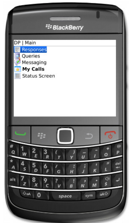
HMDT main screen

Simple to use and requiring little user training thanks to a clear and intuitive interface design, the H/MDT application enables all officers to truly be part of the police network. Whether on foot patrol, bike patrol, or in a boat, the ability to provide officers with quick and easy access to critical police information from anywhere is sure to be appreciated by the Versaterm user community.